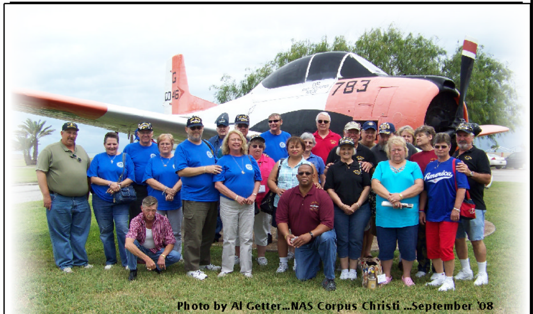
NAS Corpus Christi...September '08